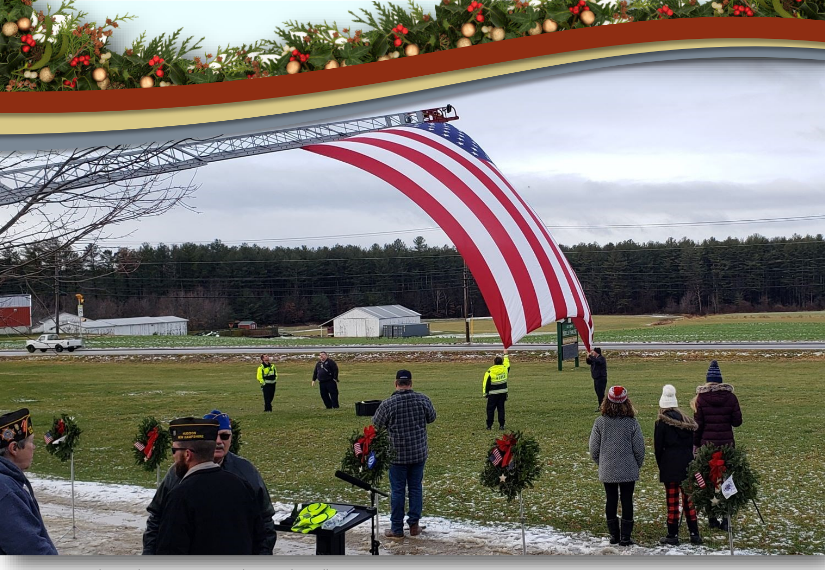
2022 Hudson Police Department Color Guard at Hills House

Hills Farm Cemetery remains active and is under the jurisdiction of the Hills Farm Cemetery Trustees. 118 veterans from all wars and conflicts are remembered here on Wreath Day