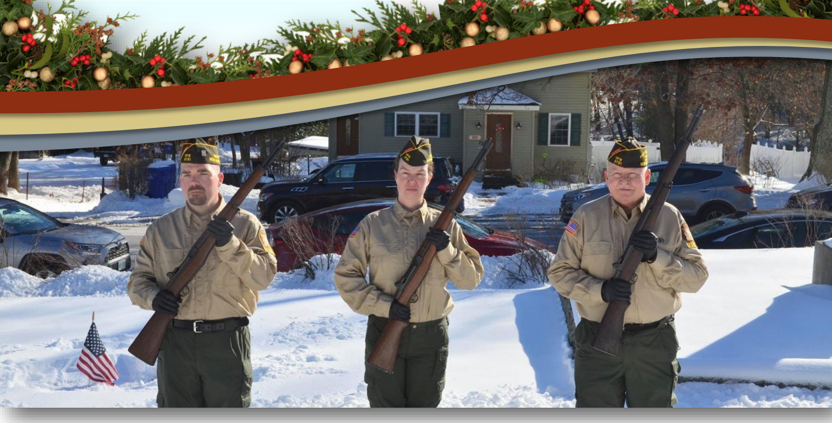
VFW Honor Guard at Sunnyside Cemetery

Sunnyside Cemetery —As the town grew and burial space in the older cemeteries became limited, the need for this cemetery arose. It is located on the north side of the highway at 98 Central Street with a stone wall and an entrance from Central Street. On Wreath Day some 75 veterans will be honored. This cemetery is closed to future burials. It is in the process of becoming a town cemetery under the jurisdiction of the Town cemetery trustees.