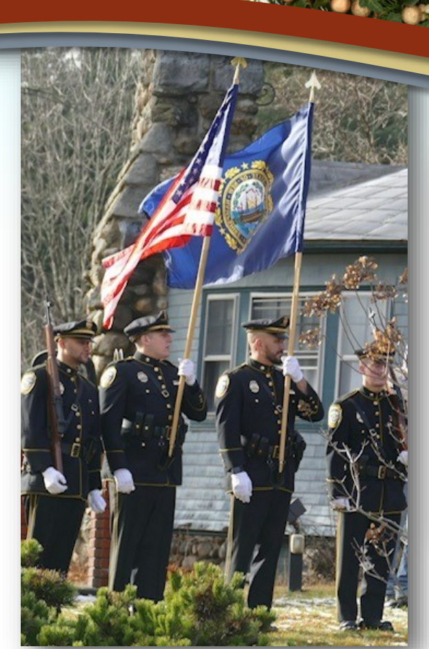
2022 Hudson Police Department Color Guard at Hills House