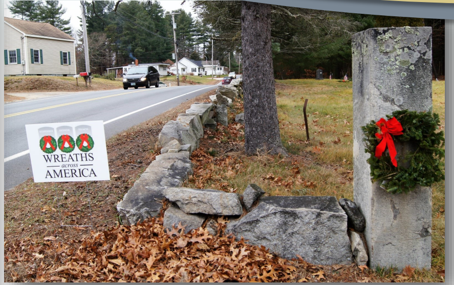
Wreath entrance at Westview Cemetery

Following the ceremony snacks and hot drinks will be available inside the Hills House, providing an opportunity to visit one another and view the downstairs of the House which has been decorated for the holiday season.