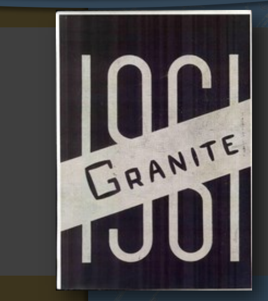
1961 University of New Hampshire Yearbook