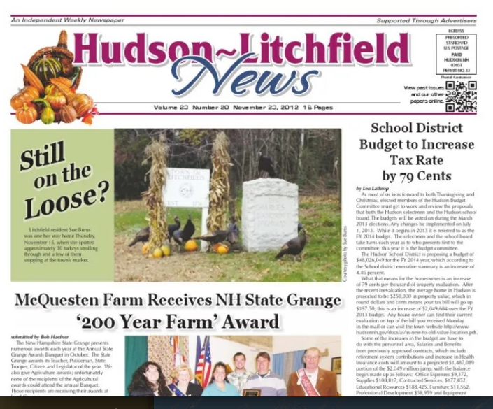
Hudson-Litchfield News, November 23, 2012 edition