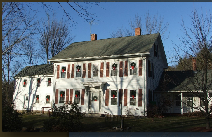
Parker Family Home

but it had a previous life, from 1886 to 1905, in the belfry of the former Chapel of the Angels on Lowell Road, which served as a mission chapel of the Good Shepherd Episcopal Church in Nashua. (You can read about it in more detail elsewhere in this issue of the Crier.)