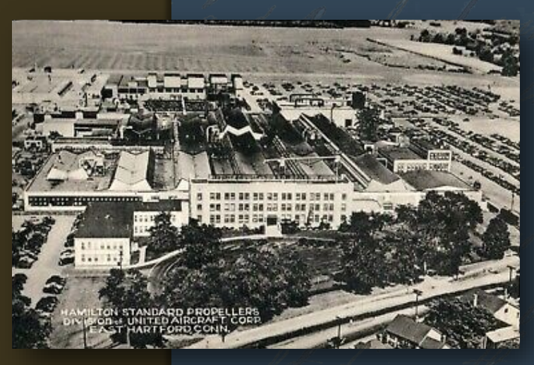
United Aircraft Corp., East Hartford Connecticut