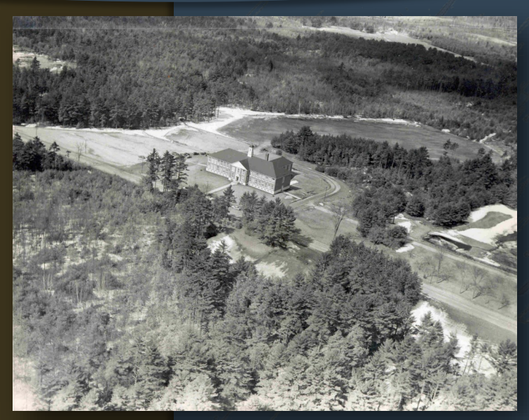
Alvirne High School circa 1949– 1950