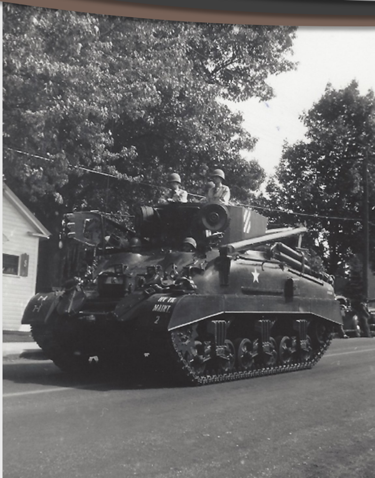
Sherman Tank on Ferry Street 1949