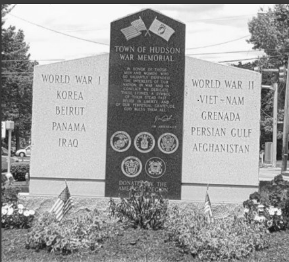
War Memorial at Library Park 2016