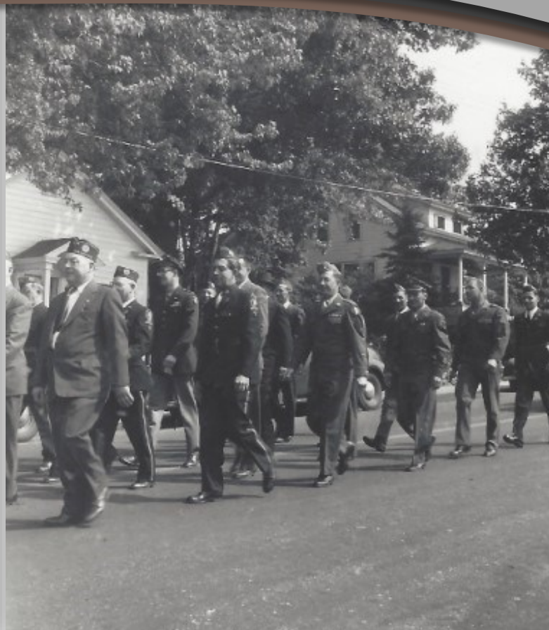
Memorial Day Parade 1949