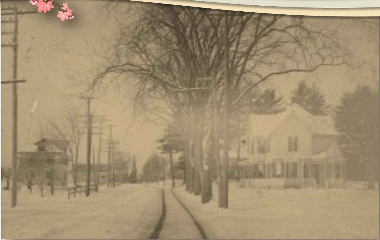
Central Street West 1907 — Tracks From Trolley Going West

The park entrance is built on a part of the old railroad bed. After crossing the river, the steam railroad continued northeasterly, crossing over Lowell Road and the street railroad on a trestle just south of the junction with Central Street, near Hammond Park. The train continued to the station at Hudson Center, off Greeley Street and behind Wattannick Hall. It then proceeded east to West Windham. In this C 1910 photo we are looking upriver at the railroad bridge and the newly constructed cement Taylor's Falls Bridge.