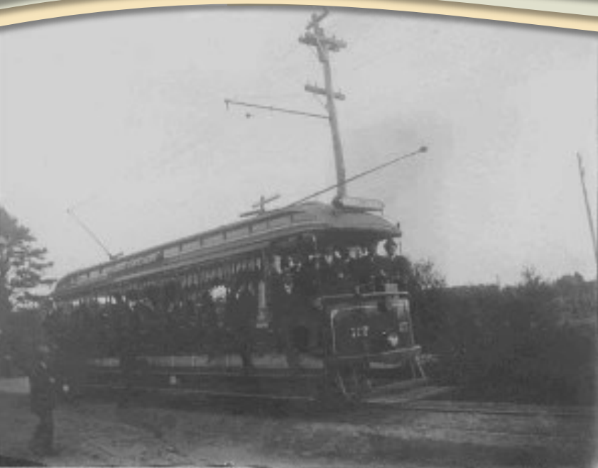
The First Electric Car At Hudson Center, N.H.