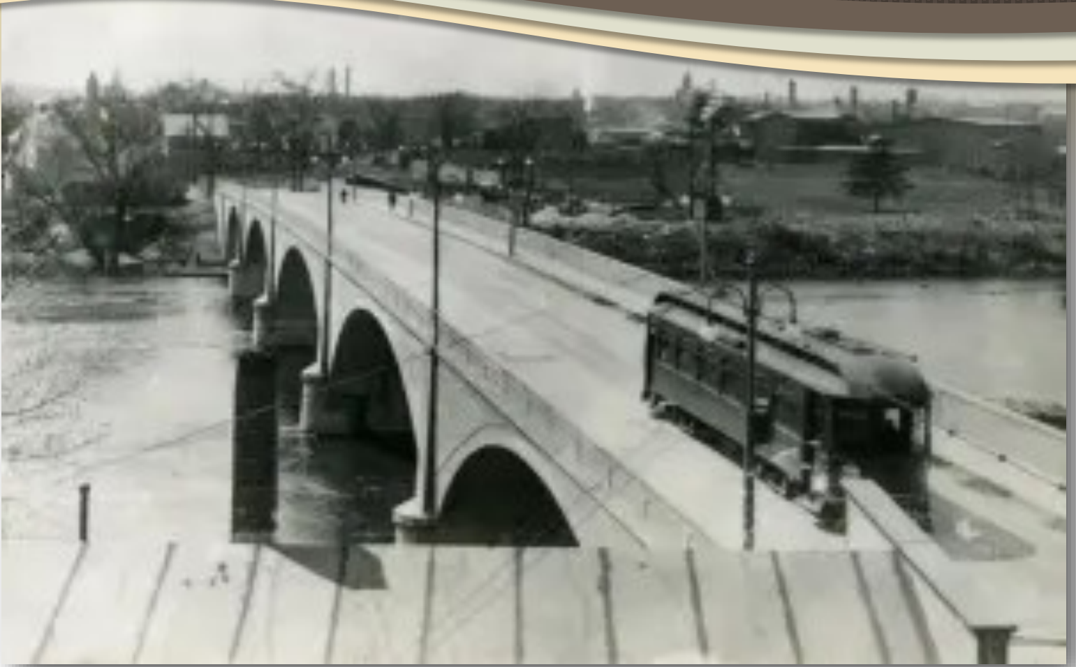
Trolley on Bridge c 1910

A trolley line from Taylor Falls bridge traveling north along Webster Street, through Litchfield, Goffs Falls, and Manchester was incorporated in 1905. The line opened for public travel 1907 with a 12 mile trip from the bridge to Goffs Falls at a cost of 20 cents and a running time of 45 minutes. Trips were made every hour in winter months and every 1/2 hour during the summer months.