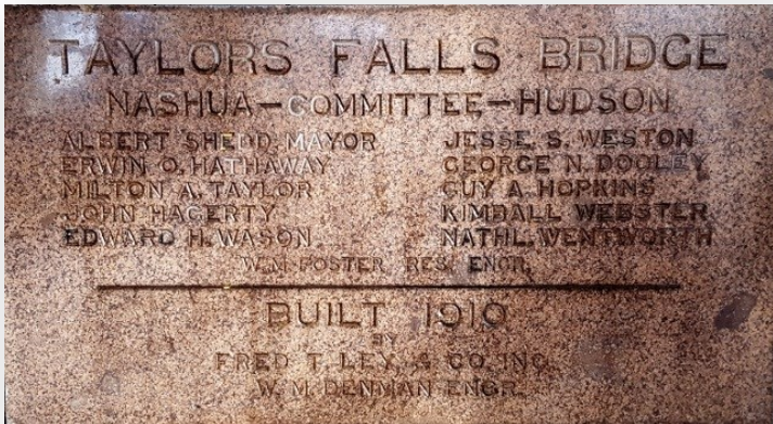
Red Granite Plaque at Midpoint of Bridge

A final inspection was made, and the bridge was accepted in November 1912.