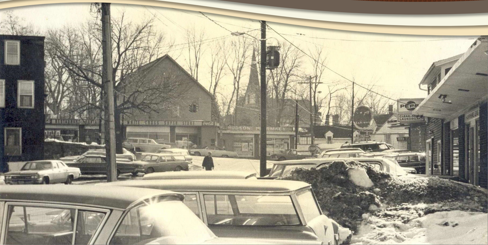
Ferry Street, White Cross from Webster Street

crossing the bridge and emergency repairs were planned.