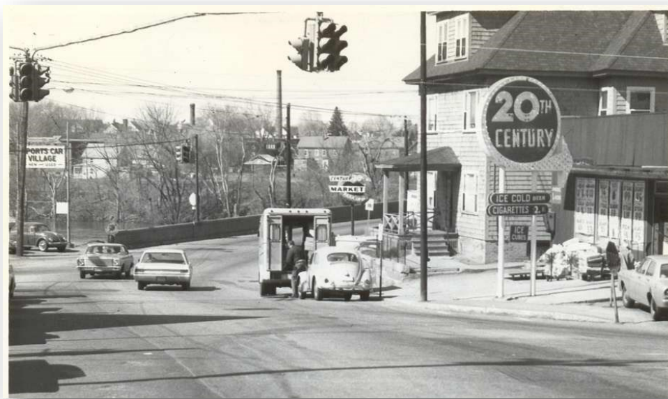
20th Century Store at the Bridge