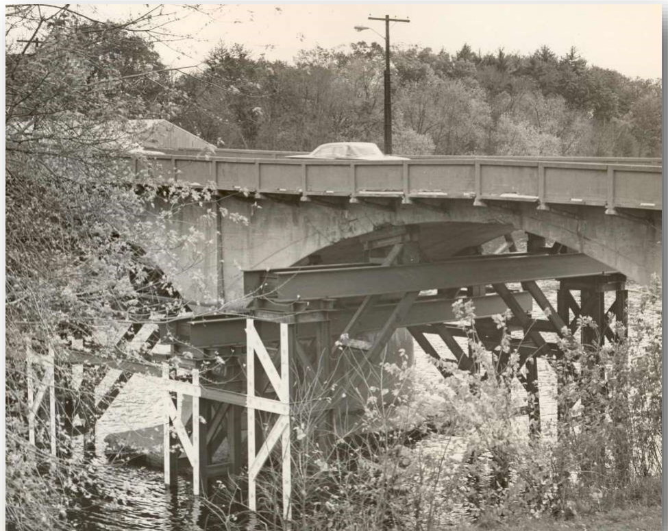
Repairs to Extend Life of Bridge

In 1960 the State of New Hampshire commissioned an engineering firm to conduct studies and make recommendations relative to the ever-increasing east-west traffic flowing between Hudson and Nashua. The resulting report stimulated discussion and controversy which required some 7 years to resolve. During that time traffic problems continued. Traffic continued to increase placing more and more stress on the existing, inadequate, and deteriorating concrete bridge. Almost unnoticed, the bridge had slowly deteriorated to a point of real danger. Load limits were placed on vehicles