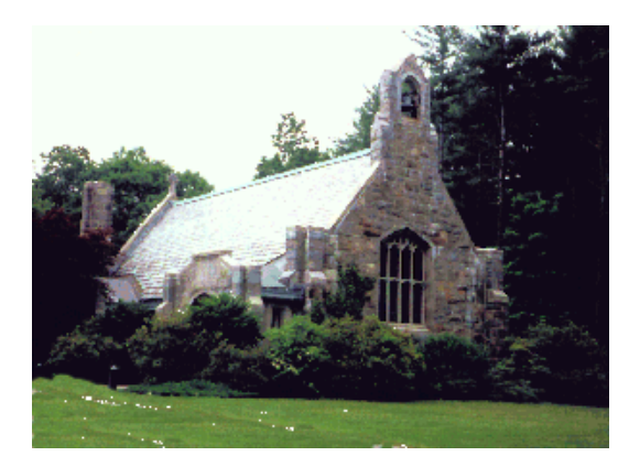
Alvirne Memorial Chapel