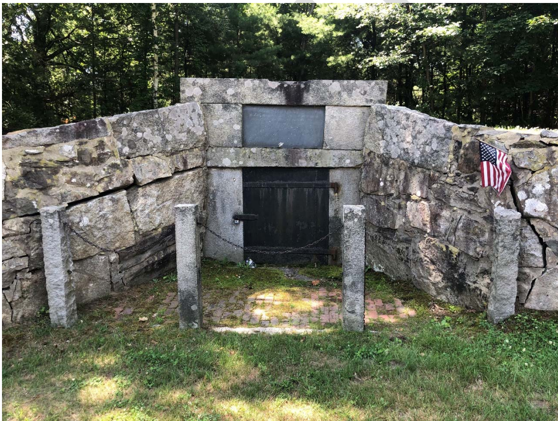
Tenney Family Tomb in Hudson Center