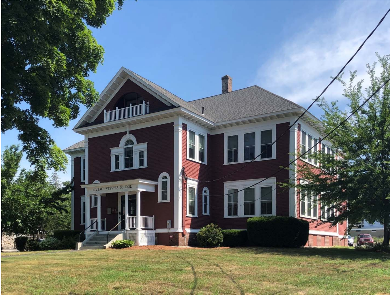
Kimball Webster School Building