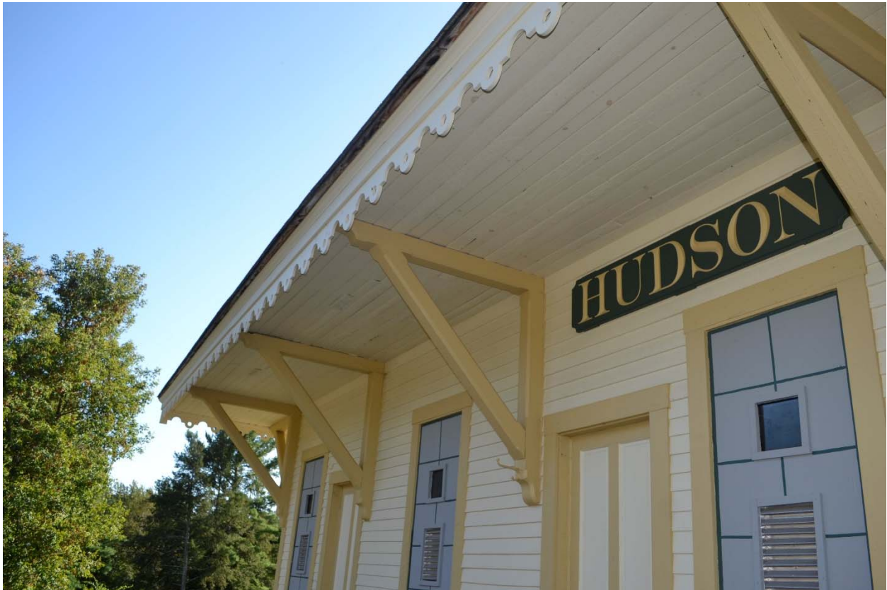
B&M Railroad Depot at Benson Park

To better connect Hudson Center to Benson Park, improved bicycle and pedestrian accommodations along Center Street, including a signalized pedestrian crosswalk at the intersection of Kimball Hill Road, Greeley Street and Central Street should be pursued, thereby bringing together two of Hudson's most important historic and cultural areas and creating the semblance of a town center for Hudson (see Chapter V-Transportation).