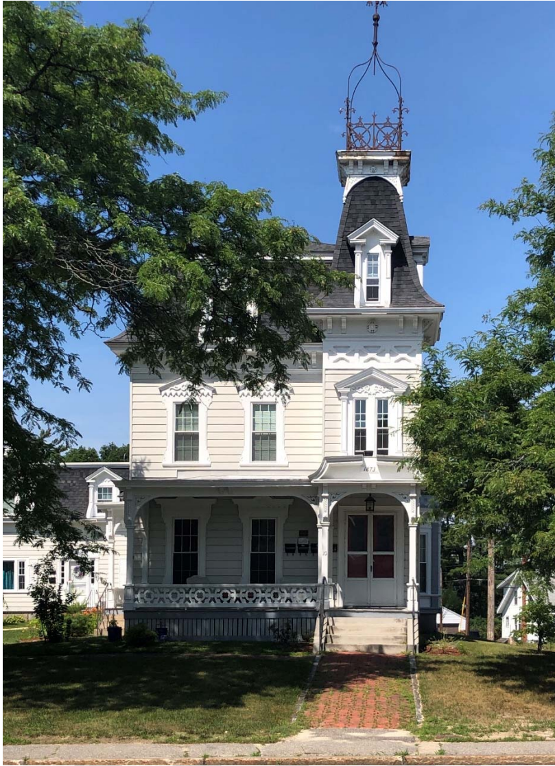
G.O. Sanders House

projects, might have on a property which is listed on the Register or eligible for listing. Register standing can also make a property eligible for certain federal tax benefits (investment tax credits) for the rehabilitation of income-producing buildings and the charitable deduction of donations or easements.