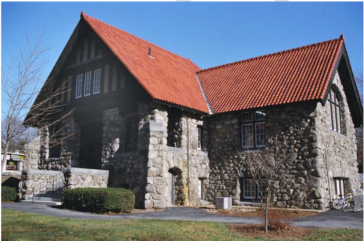
Hills Memorial Library – one of Hudson's most notable historic buildings

The quality of future planning can be enhanced in many ways by an appreciation of a community's past. Although Hudson's historic resources are overshadowed by the tremendous amount of new construction which has occurred over the past several years, the historic buildings and sites which survive play a critical role in defining the town's character and connecting the present with the past. Like many environmental resources, historic resources are precious, fragile, and nonrenewable and may be lost without awareness, respect, and adequate protection. Hudson's historic resources also play an important role in contributing to the rural and small-town character valued by so many Hudson residents. Further, the largest remaining concentrations of historic buildings and sites in Hudson are located in areas that have the greatest potential to develop into the defined Town Center that is one of the key goals of the Master Plan (see Chapter I – Community Vision and Goals). These areas include the Taylor Falls Bridge area and Hudson Center together with Benson Park. Each of these areas is described in greater detail on the following pages.