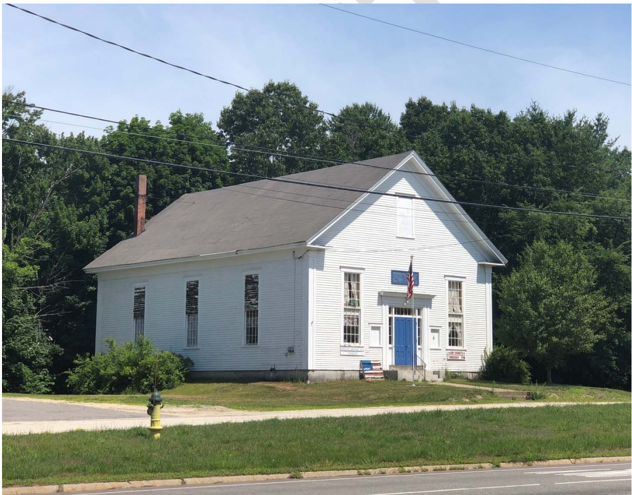
Town House (Grange Hall) in Hudson Center

relocation of several structures in Hudson Center and in the taking of a large part of the town common. A proliferation of commercial activity just west of Hudson Center and industrial areas to the east has isolated Hudson Center in recent decades, though another significant concentration of historic buildings and sites is located nearby in what is now known as Benson Park.