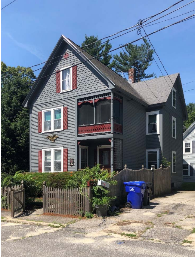
Historic Home on Maple Street

The area which developed adjacent to the Taylor's Falls Bridge crossing the Merrimack River became the dominant center in the late 19 th and early 20 th Century. The original bridge was built as a 16-foot wide covered toll bridge in 1827. It was not until the arrival of the electric railway in 1895 that a densely populated area had been settled at the bridge crossing.