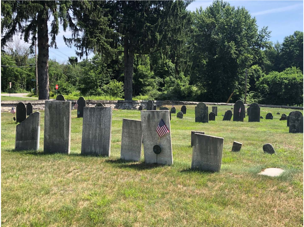
Old Hudson Center Cemetery