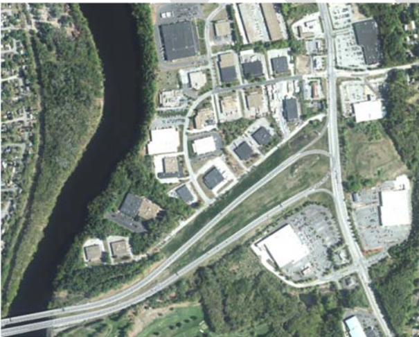
Above: Aerial Photo of Sagamore Bridge Area

Hudson, with an area of 29.2 square miles, is the sixth-largest municipality in the Nashua region and has the second-highest population density in the region (see Chapter II). Hudson has grown dramatically over the past few decades both as a bedroom community for Nashua and employment centers in Massachusetts as well as a center of employment in its own right. By the close of the 19th Century, most of Hudson's 1,200 residents were concentrated in the vicinity of the Taylor's Falls Bridge area. The remainder of the population was located in the old Hudson Center area on NH 111, on fertile farmlands along the Merrimack River, scattered along major roadways and on more isolated farmsteads throughout what was an overwhelmingly rural community. The Town's commercial uses were few and