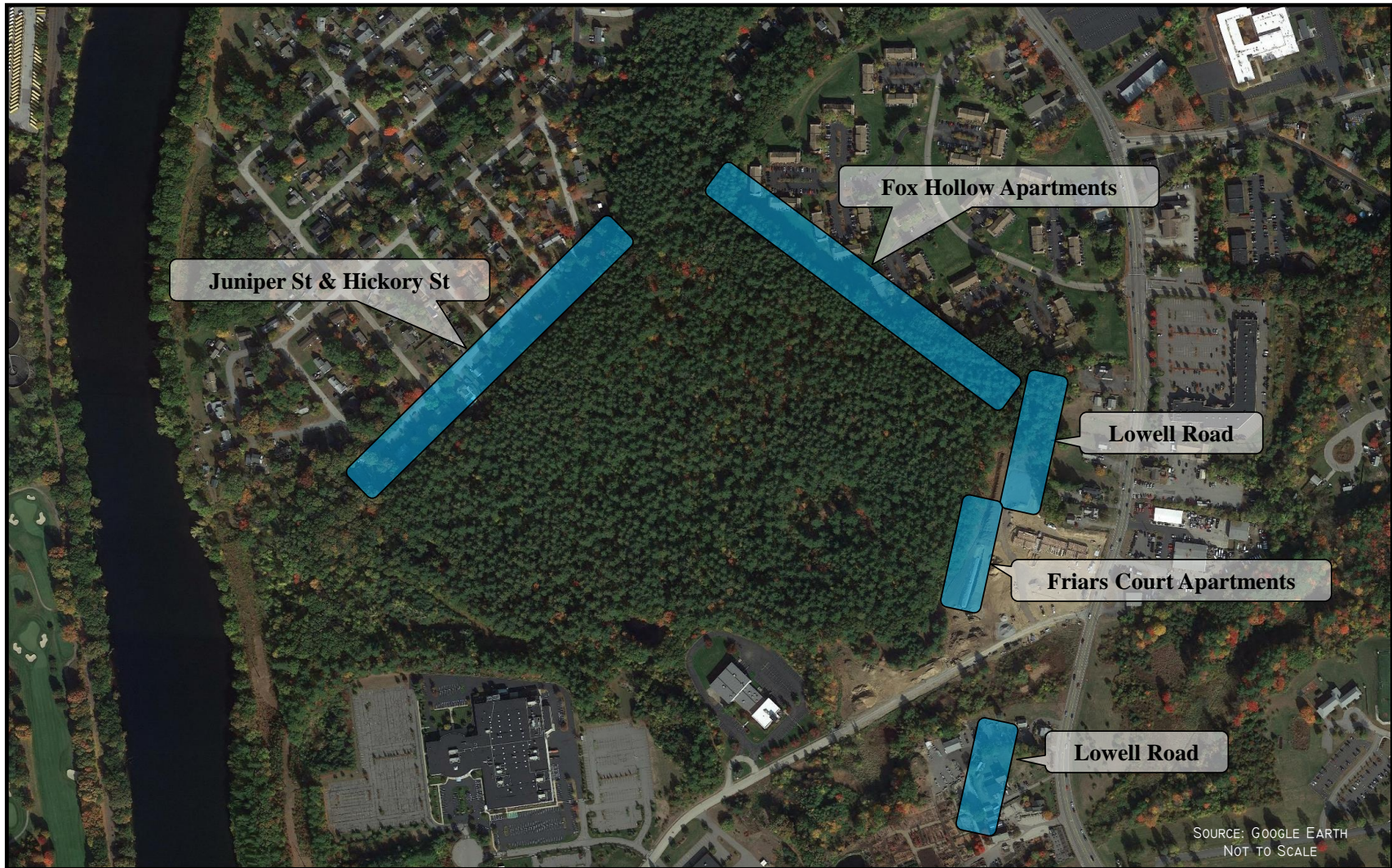
Figure 2 Residential Modeling Locations 161 Lowell Road Warehouse Development, Hudson, NH