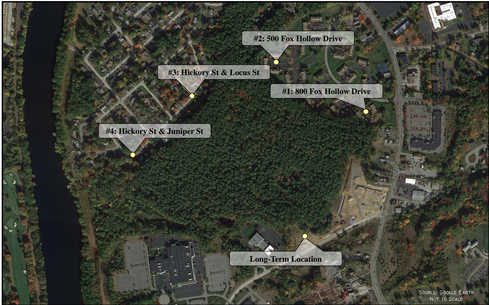
Figure 1 Sound Monitoring Locations 161 Lowell Road Warehouse Development, Hudson, NH