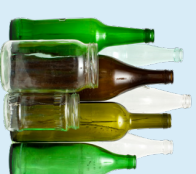
Glass Bottles & Jars (Empty food & beverage bottles & jars)