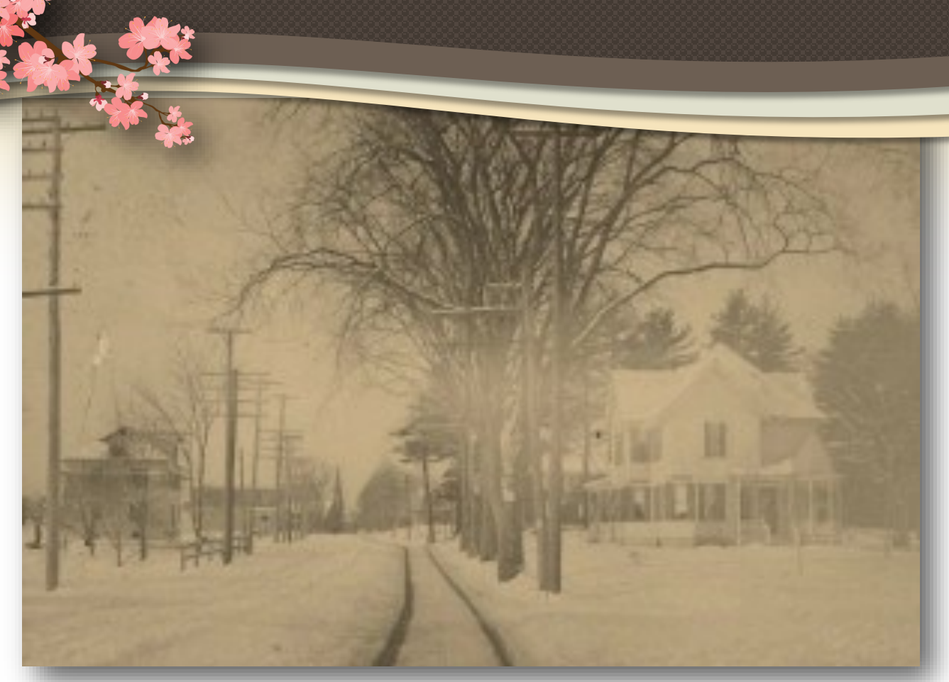
Central Street West 1907 — Tracks From Trolley Going West

The park entrance is built on a part of the old railroad bed. After crossing the river, the steam railroad continued northeasterly, crossing over Lowell Road and the street railroad on a trestle just south of the junction with Central Street, near Hammond Park. The train continued to the station at Hudson Center, off Greeley Street and behind Wattannick Hall. It then proceeded east to West Windham. In this C 1910 photo we are looking upriver at the railroad bridge and the newly constructed cement Taylor's Falls Bridge.