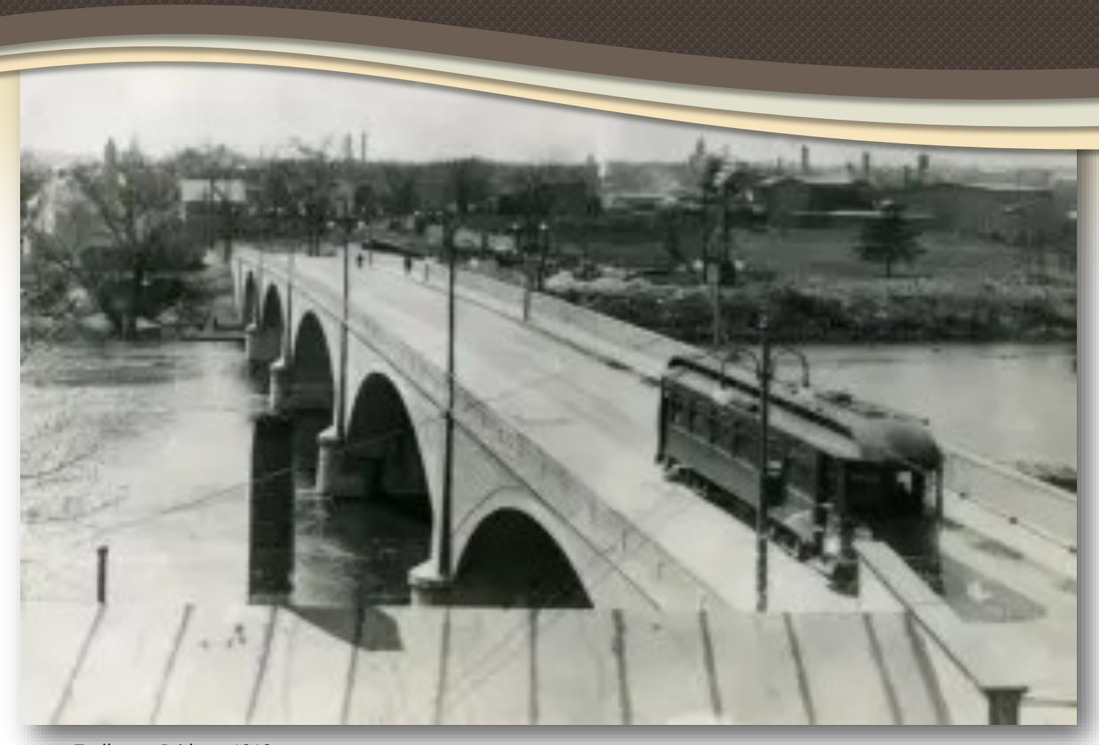
Trolley on Bridge c 1910

A trolley line from Taylor Falls bridge traveling north along Webster Street, through Litchfield, Goffs Falls, and Manchester was incorporated in 1905. The line opened for public travel 1907 with a 12 mile trip from the bridge to Goffs Falls at a cost of 20 cents and a running time of 45 minutes. Trips were made every hour in winter months and every 1/2 hour during the summer months.